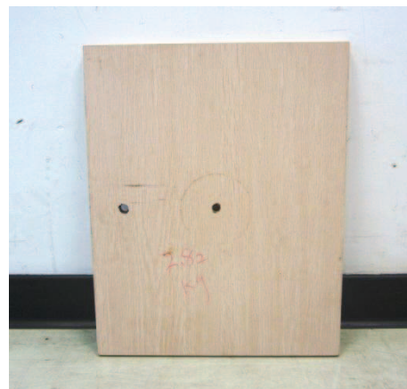
Pic. 2: Overview _ door for test